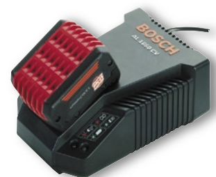
Charger and two batteries included